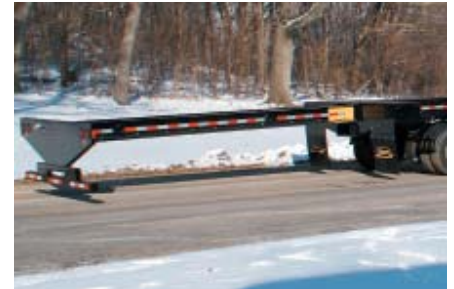
Pull out rear underride bumper (optional)