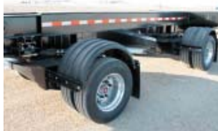
Dual turntable wireless steering