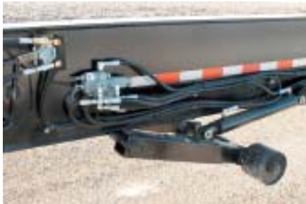
Hydraulic lift dolly (for closing and extending)